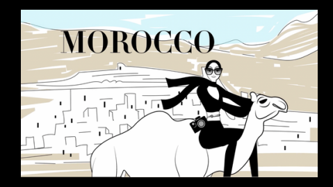
A THOUSAND AND ONE NIGHTS