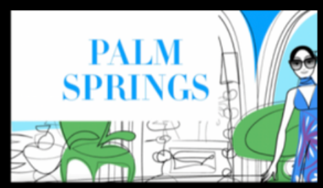
MID CENTURY CHIC