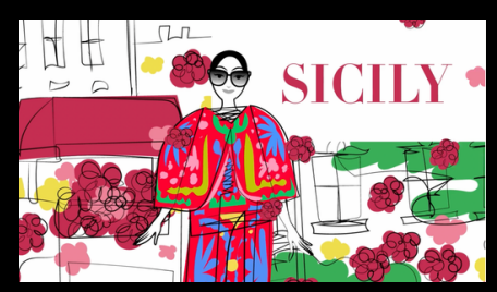
UP AT THE VILLA