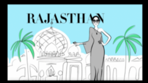
A DESERT OASIS